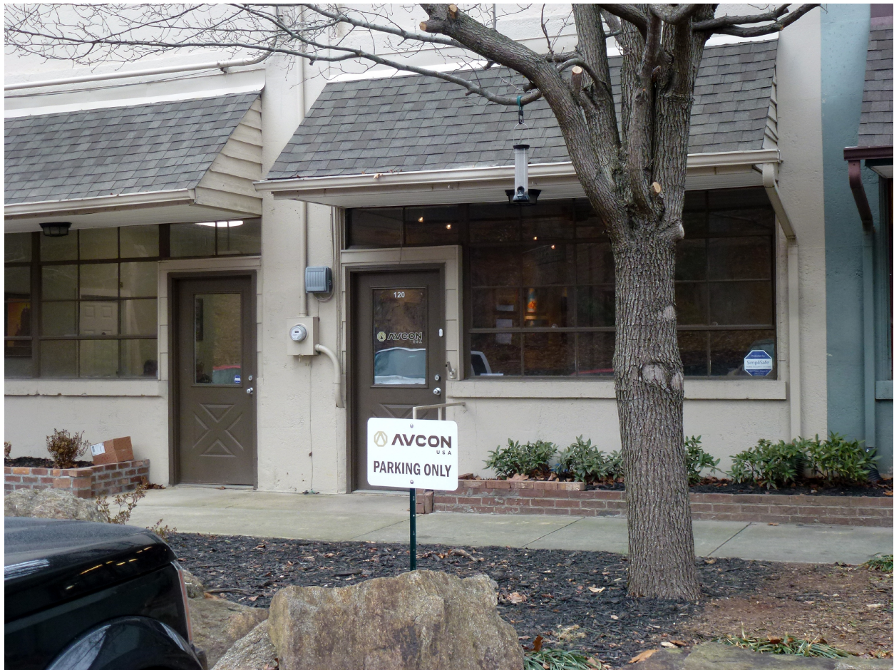
Avcon USA, LLC, 120 Miller Street, Waynesville, NC 28786